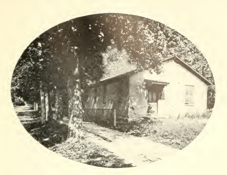
SCHOOLHOUSE AT WARSAW, ILLINOIS